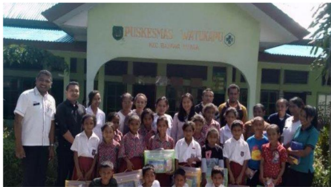
Figure 1 Watukapu Public Health Center, Ngada, East Nusa Tenggara

Posyandu Bersayap program covers several activities: