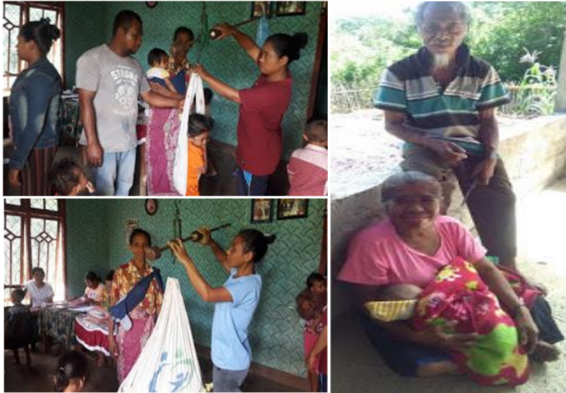
Figure 4 The Participation of Father (Top Left), Grandmother (Bottom Left), and Grandparents (Right) in Helping Children Weighing