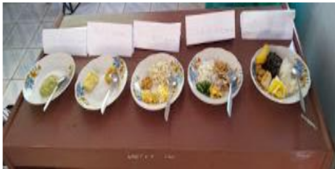
Figure 8 Food Product from The Program Appropriate with Age, and Serving Size for Children