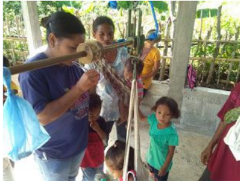
Figure 6 Recording of Weighing and Height Measurement Result