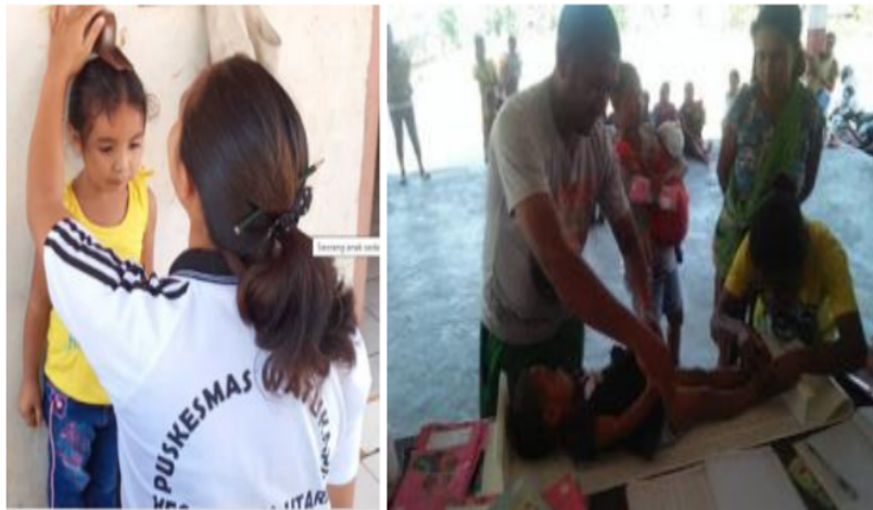
Figure 5 Height Measurements

Routine weighing and height measurement can be used to monitor the nutritional status of infants and toddlers, improve nutritional status and prevent stunting. Based on the results of the research, there was a relationship between regular Posyandu visits and the nutritional status of children under-five based on weight/ age at Posyandu Ngudi Mulyo Dusun Kembu, Waru, Kebakramat, Karanganyar with a correlation coefficient value of 0.668 with a significance of 0.000 (Riawati & Sari, 2019).