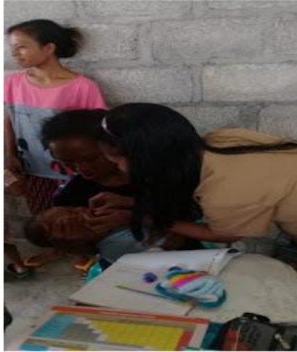
Figure 9 Polio Immunization