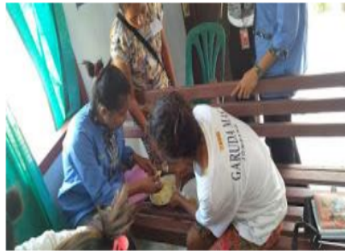
Figure 7 Food Serving Practice Using Provided Food for Under-Five Children Appropriate with Age, and Serving Size for Children

In nutrition counseling activities, parents (father, mother, or children's caregivers) were given counseling on the use of local food to fulfill nutrition for children under five. Local food such as corn, cassava, moringa, mung bean ( vigna radiata ), and fish. Feeding children with mung beans and fish can overcome malnutrition (Amra & Juhartini, 2018). The addition of biscuits with a mixture of moringa has been shown to affect weight gain in toddlers with underweight nutritional status (Juhartini, 2016).