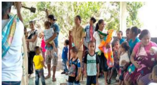
Figure 2 Fathers and Child Caregivers Participating in The Program

Figure 2 is the implementation of the Posyandu program refers to the five-table Posyandu implementation guidelines (Kemenkes RI, 2011). The innovation of the Posyandu Bersayap is to involve fathers or child caretakers other than mothers including grandparents or babysitters which is proven in increasing the participation of under-five visits for weighing.