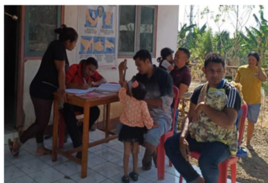
Figure 3 Participations of Fathers in Childcare can Increase Affection/Bounding Attachment between Fathers or Accompanying Caregivers with Children